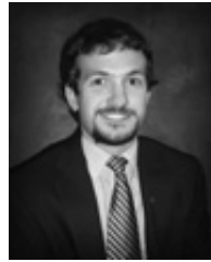
2011 4th Quarter Winner